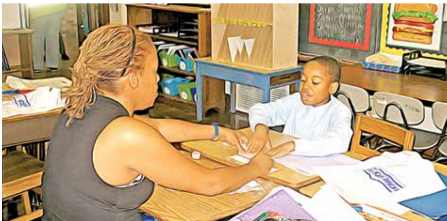
Mother helps son with academics at Parent Teacher Learning Team meeting, Dewey International School, St. Louis Public Schools.